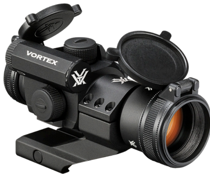
Cantilever Ring Option (Lower 1/3 Co-Witness Height)

The StrikeFire® II includes a cantilever mount. The cantilever ring mount puts the optic bore center 40 mm above the base, providing lower 1/3 co-witness with iron sights on flat top AR-15 rifles.